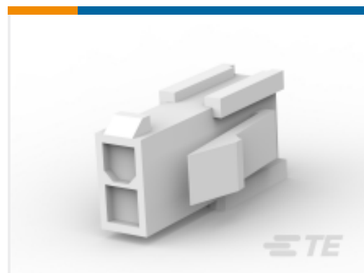
TE Part # 1586861-2 2P PM PLUG VAL-U-LOK PM GW