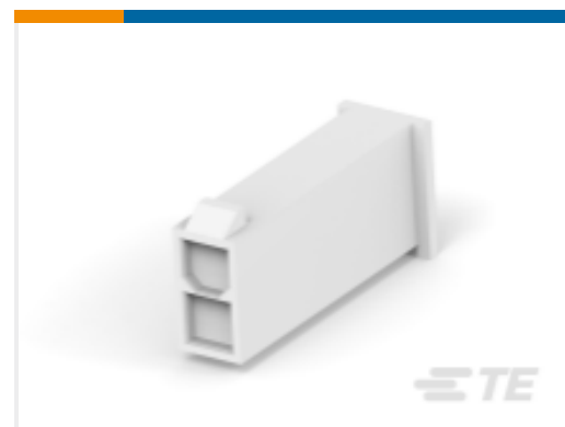
TE Part # 2296206-2 2P FH PLUG VAL-U-LOK FH GWT/V0