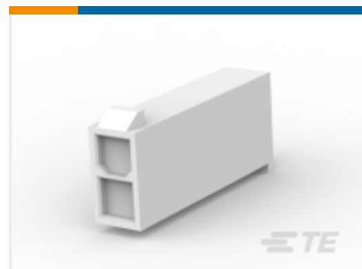
TE Part # 1586862-2 2P FH PLUG VAL-U-LOK FH GW